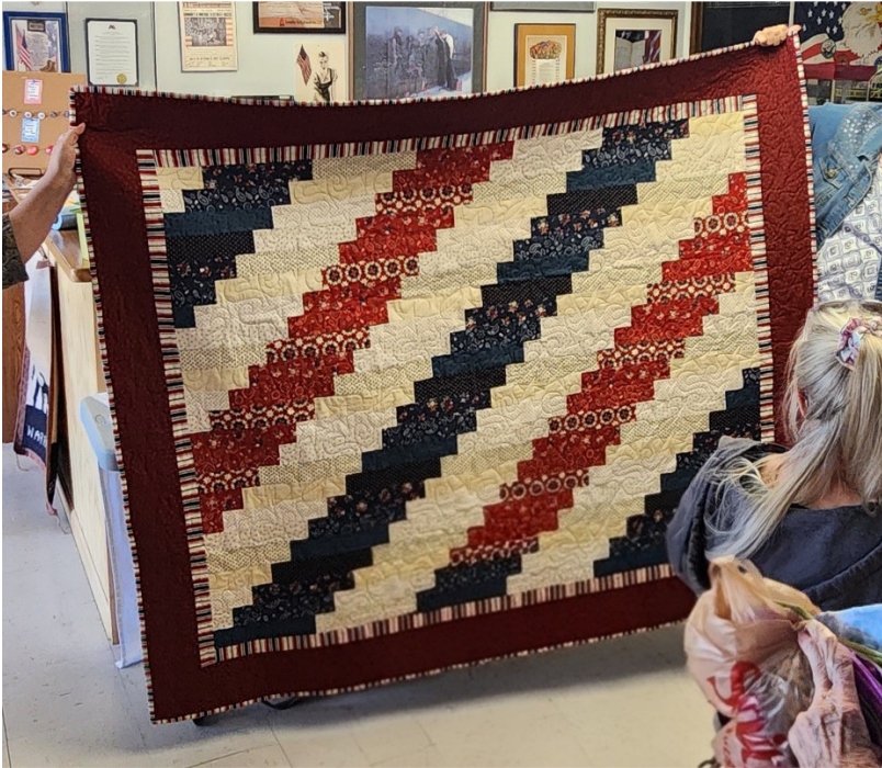
Beautiful quilting work!