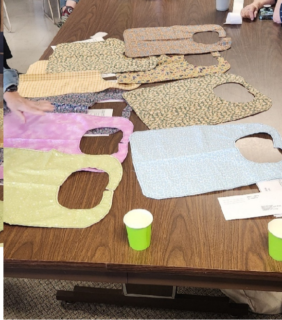
Our new Winter model!