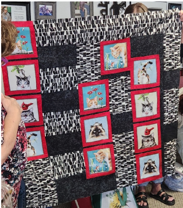
Adorable Kitty Kat quilt!