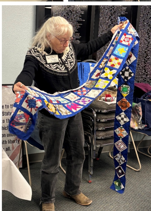
There are 250 different blocks to assemble!