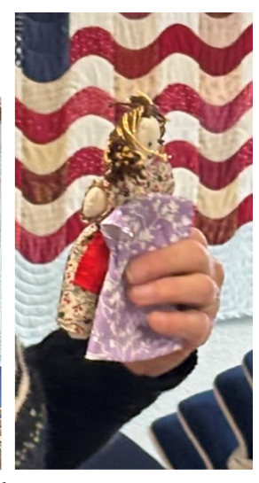
Paula shared many of her Completed projects from 2024!