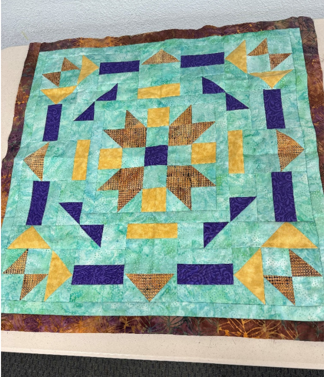
Sally's progress....she reminds us to mark our pieces! Laurel's center block!