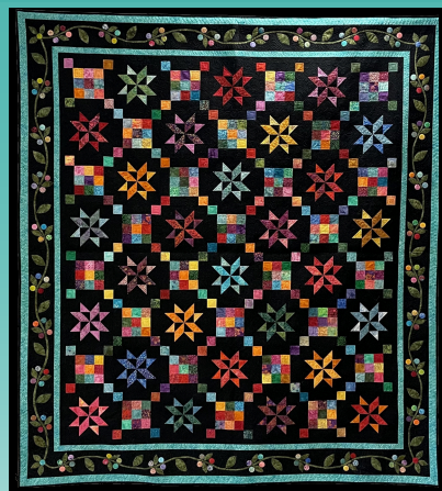
"Star Light, Star Bright" Queen Size

RAFFLE TICKETS FOR THIS QUILT AVAILABLE PRIOR TO SHOW AT THE DOLORES VISITOR CENTER OR CORTEZ QUILT COMPANY $2 EACH OR 3 FOR $5